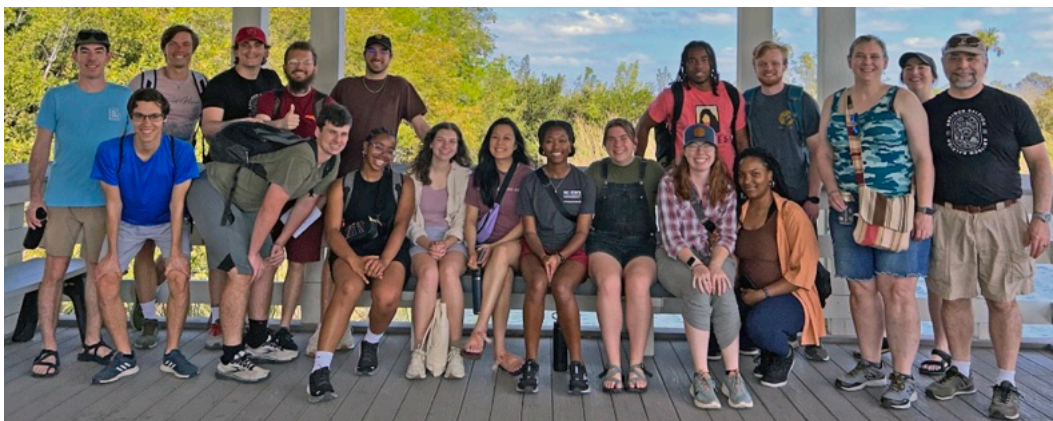
Students and staff enjoying a morning of rest at Everglades National Park.