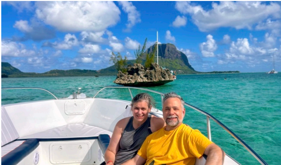
In the water behind us is a formation called Crystal Rock. Behind that is Le Morne, which we climbed halfway up a few days before.

called it a wonderful "vacation from decision-making." Just walks along the beach, sitting by the pool and reading books. Introvert paradise. The most we planned was a short hike halfway up a nearby mountain and a boat ride for an hour of snorkeling among tropical fish.